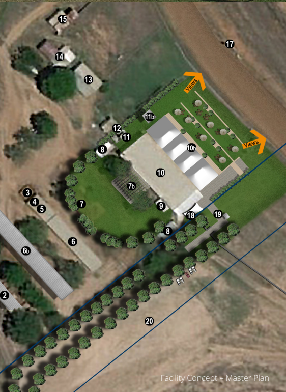
Facility Concept – Master Plan