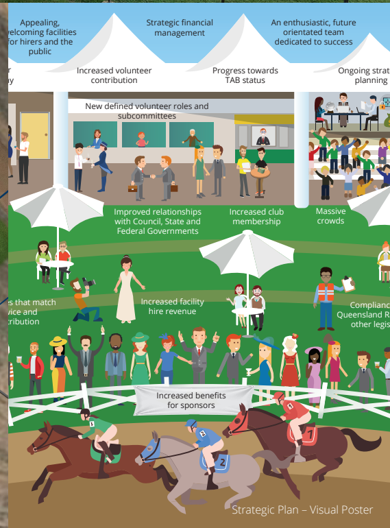
Strategic Plan – Visual Poster