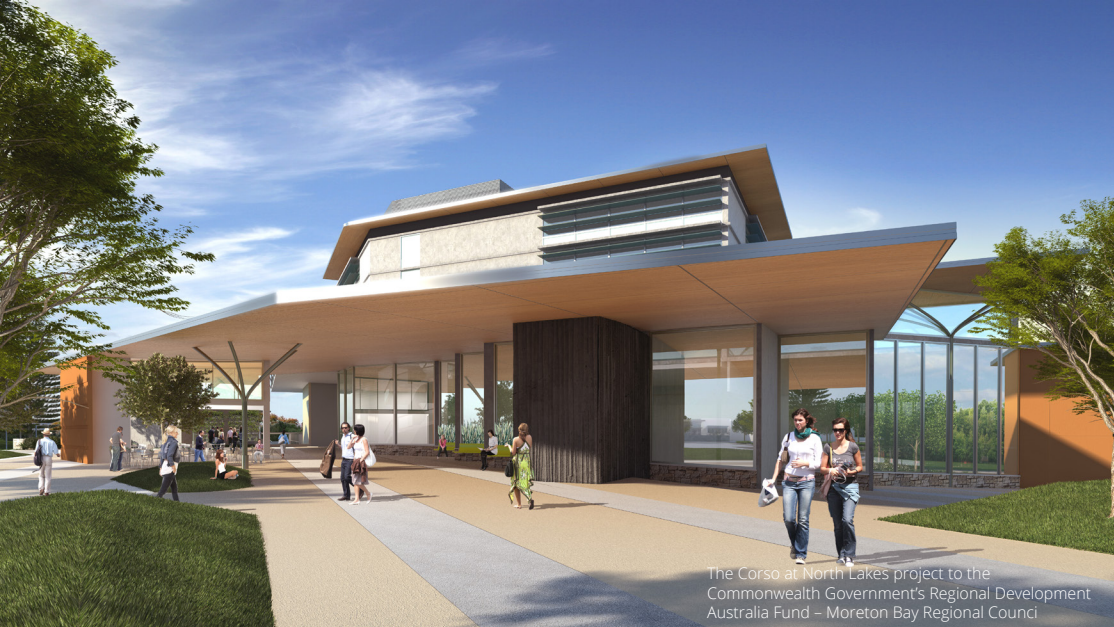
The Corso at North Lakes project to the Commonwealth Government's Regional Development Australia Fund – Moreton Bay Regional Council