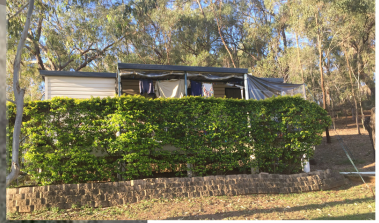
Caretakers Residence Before