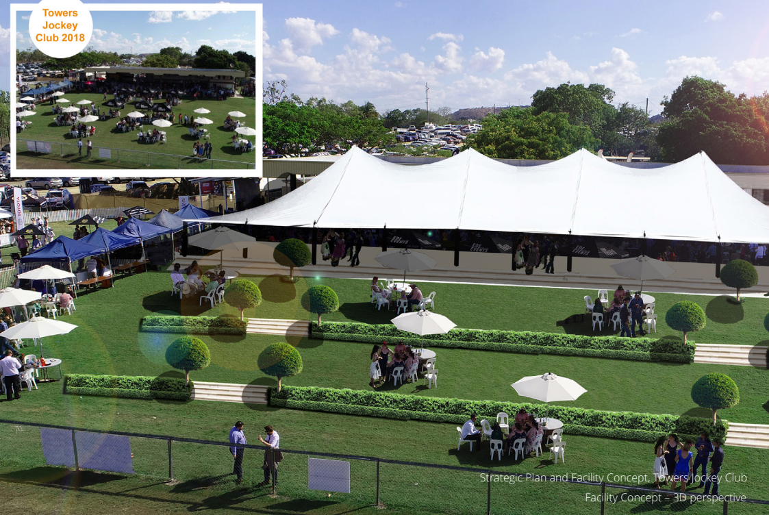
Strategic Plan and Facility Concept, Towers Jockey Club Facility Concept – 3D perspective