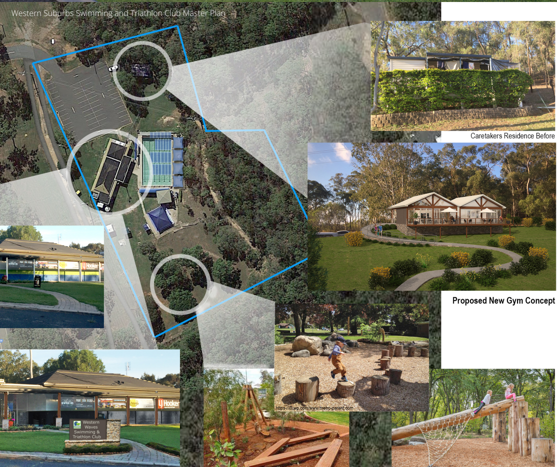
Western Suburbs Swimming and Triathlon Club Master Plan