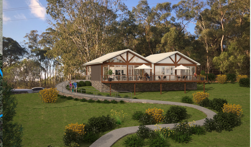
Proposed New Gym Concept