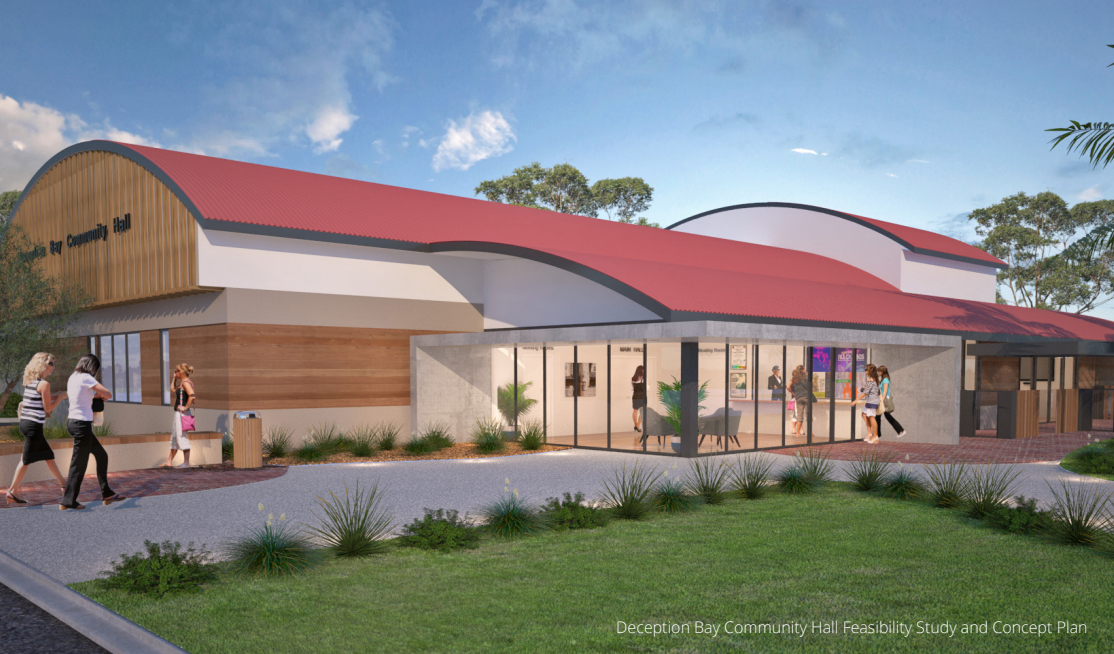
Deception Bay Community Hall Feasibility Study and Concept Plan